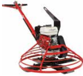
36" Walk Behind Trowel

Combo blades come with rental. Finish blade and pans purchased separately.