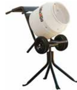
Portable Electric Powered Concrete Mixer