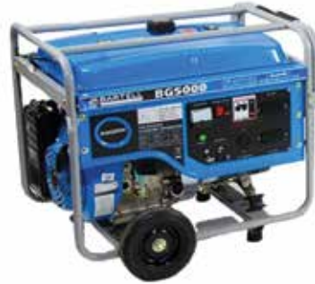
Generator - 5,000 Watt