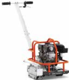
Soff-Cut 150 Walk Behind Saw