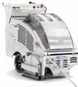
Soff-Cut 4200 Walk Behind Saw