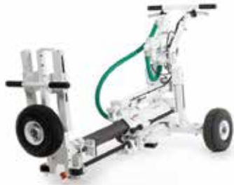
Minnich A-1 Series - On Grade