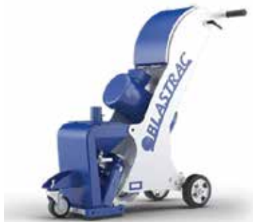
8" Electric Powered Shot Blaster