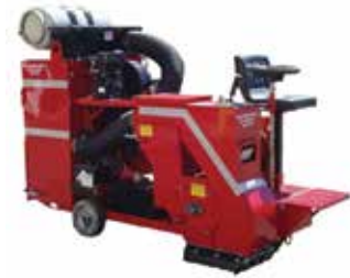
Blastrac 10" Propane Powered Riding Shot Blaster