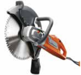
K 4000 Electric Power Cutter