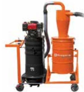
Soff-Cut 1000 Soff-Vac