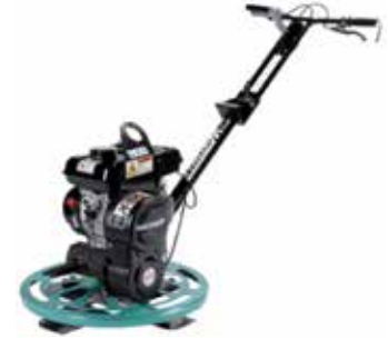
24" Walk Behind Edging Trowel