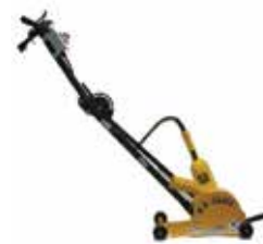
Stand-Up Joint Clean-Out Saw