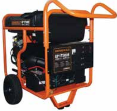
Generac 17K kW Generator