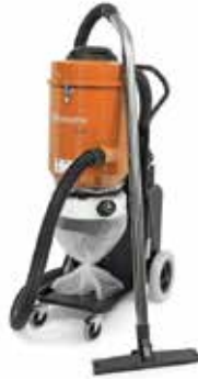
Industrial HEPA Vacuum (S26)