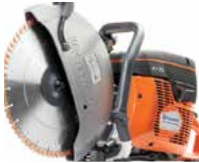
K 770 14 in Cut-Off Saw