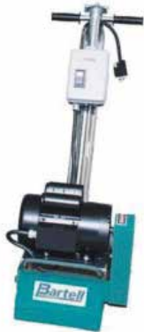
8" Electric Scarifier

Note: Pricing on all grinders includes up to 30 grit diamond segments and PCD's. Our scarifiers include drum. Shot sold separately.