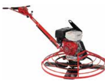
48" Walk Behind Trowel