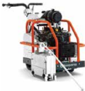
Soff-Cut 4000 Walk Behind Saw