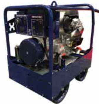
Makinex 23kW 480 Volt 3-Phase Portable Generator