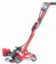
4.5" Crack Chasing Saw