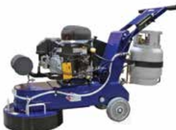
18" Propane Floor Grinder (TG-18)