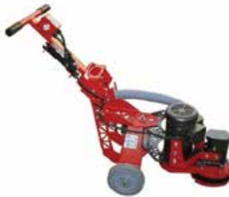
7" Edge Grinder (EG-7)