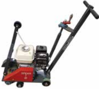
7"- 9" Walk Behind Concrete Saw