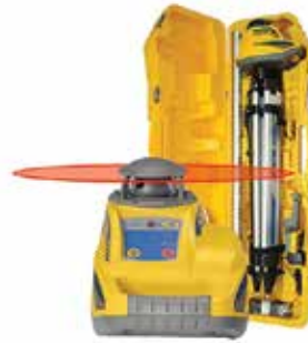
Spectra HV101 Laser Kit

The HV101 laser transmitter is automatically self leveled in the horizontal and vertical planes and sends a continuous 360-degree laser reference over the entire work area. The HV101 laser is easy to set up and use and is rugged enough for the toughest jobsite.