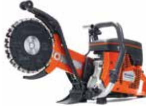
K 760 Gas Cut-N-Break Saw