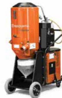
HEPA Filter Vacuum (T8600) Propane or Electric