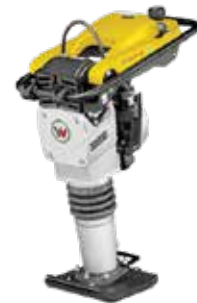
Jumping Jack Rammer

Engine/Motor: 2 cycle - gasoline Percussion Rate Max: 687 blows/min Operating Speed: 31.2 ft/min Ramming Shoe Size: 9.8" wide x 13.4" long Weight: 130 pounds