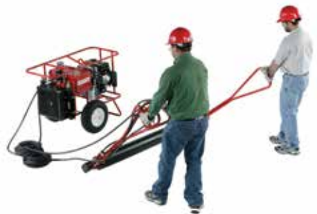
Roller Tube Finisher

Weight: 220 lbs Engine: Kohler CH440 Tube Diameter: 6.5 in Tube Length: Choice of 6, 8, 14, 16, 18, or 26 ft