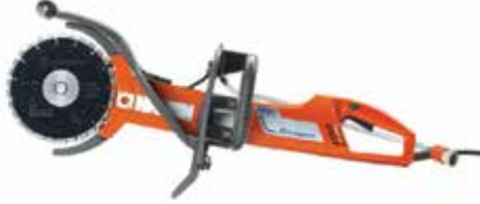
K 4000 Electric Cut-N-Break Saw