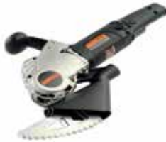
Arbortech Brick and Mortar Saw

The AS170 Brick + Mortar Saw represents a revolution in cutting technology. Using a unique patented orbital cutting motion with two forward facing blades that combine to perform both a hammering and cutting action. Blade not included.