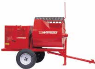
Gas or Electric Powered Towable Mortar Mixer