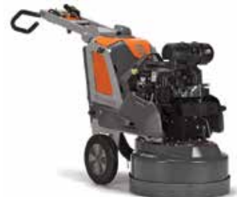
PG 690 Propane Grinder - 3 Head