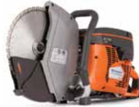
K 770 VAC Concrete Saw with Dust Control