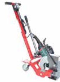
GCT 10, 9" Electric Saw