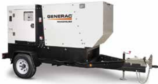
Tow-Behind Generator (Diesel)