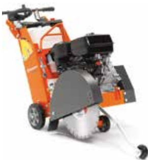
FS400 Walk Behind Saw

* Note: Compatible with all soff-cut saws