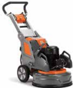
PG 540 Grinder - 3 Head

Note: Pricing on all grinders includes up to 30 grit diamond segments and PCD's. Our scarifiers include drum. Shot sold separately.