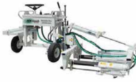
Minnich A-2C Series - On Slab