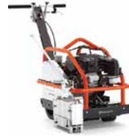
Soff-Cut 2000 Walk Behind Saw