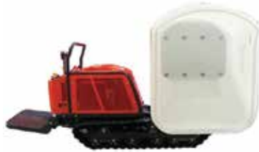
16 cu ft Canycom SC75 Pivot Dump Buggy