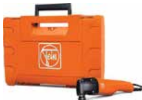
Fein MultiMaster Tool

FEIN SuperCut is the right power tool for all professionals in the interior and renovation trades. With a 400 Watt motor and stronger oscillation movement, the FEIN Supercut means maximum progress, resulting in time and cost savings. Blade not included.