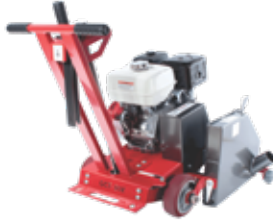
GCT-14, 14" Gas Dustless Saw