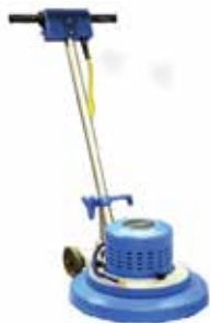
20" Floor Buffer / Scrubber