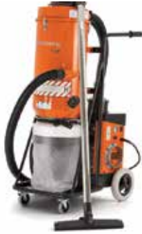
Industrial HEPA Vacuum (S36)