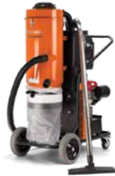
Propane Industrial HEPA Vacuum (S36)