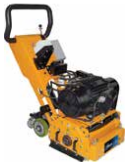
Smith 15" Electric Scarifier