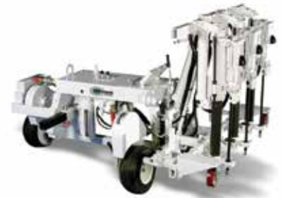
Minnich A-3C Series - On Slab