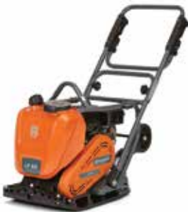
LF 80 Plate Compactor

Operating Weight: 181 lbs Centrifugal Force: 4361 lbf Speed: 108 ft/min Plate Width: 16.5"