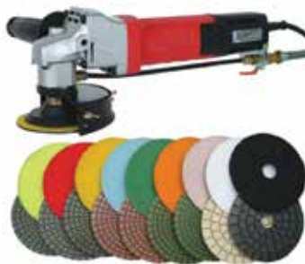
Variable Speed Hand Held Wet Polisher