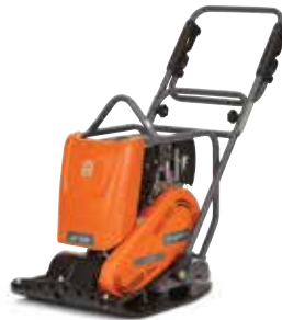
LF 100 Plate Compactor

Operating Weight: 236 lbs Centrifugal Force: 3754 lbf Speed: 82 ft/min Plate Width: 19.7"