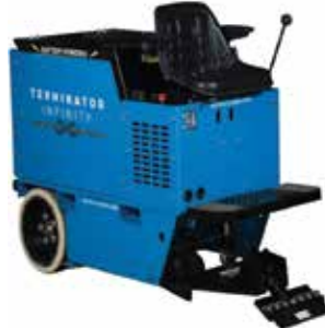
Battery Powered Riding Scraper (Terminator)