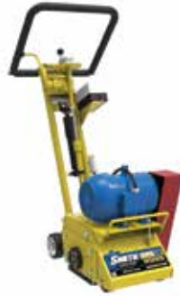
Smith 10" Electric Scarifier