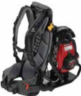
Backpack Concrete Vibrator

Engine: 4 cycle with a heavy duty clutch Weight: 30 pounds Frame: Lightweight steel Whip Length: 10' Head Size: 1 1/2" Head