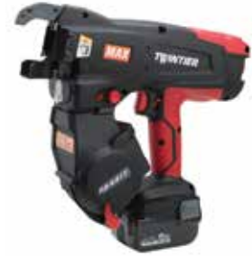
MAX Tool Rebar TwinTier RB441T

Weight: 5.6 lbs Minimum Ties Per Coil: 145 Maximum Ties Per Coil: 265 Applicable Rebar Size: # 3x #3 - #7 x #7 Ties Per Charge: 4000 Tie Speed: Approx. 1/2 sec Tie Wraps: 2 Battery Charge Time: 65 minutes full charge