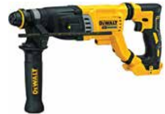
Rotary Demo Hammer 1 1/8" SDS-Plus