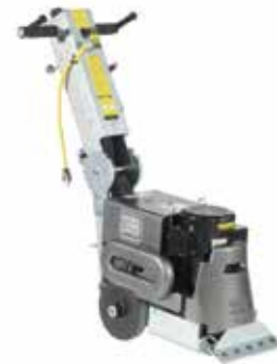
Self Propelled Walk Behind Floor Scraper