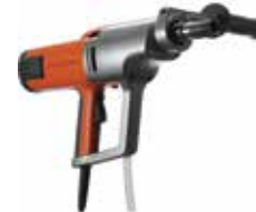
Husqvarna Hand Held Core Drill

The Husqvarna Handheld Core Drill is a core drill for drilling up to 4in. diameter openings. The unit can be used for a variety of applications including making holes for ventilation, plumbing pipes, joints, electrical sockets and telecom cables. For use with DR15 and hand-held core bits. Core bits are not included.