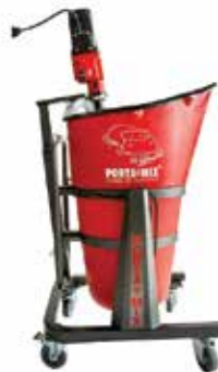
MEGA Hippo Mixing Station