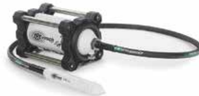
Handheld Concrete Vibrator

Engine: Double insulated motor Weight: 14.5 lbs Power: 15 amps Whip Length: 10' Head Size: 1 3/4" Head