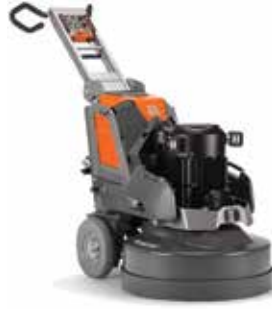
PG 830 RC Floor Grinder - 3 Head