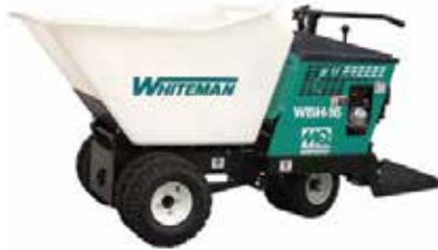
16 cu ft Concrete Buggy