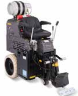
Propane Powered Riding Scraper (8000)