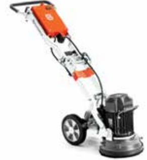
PG 280 Grinder