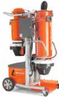
HEPA Filter Vacuum (DC6000)