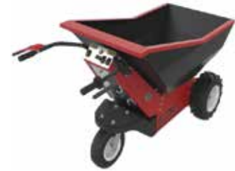
9 cu ft Power Pusher Electric Wheelbarrow