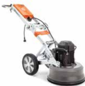
PG 450 Grinder - 3 Head