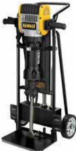
DeWalt D25980 Electric Breaker