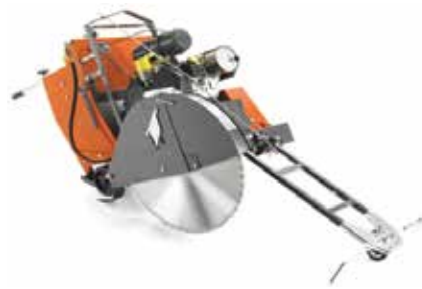
FS 3500 30" Gas or Electric Walk-Behind Saw