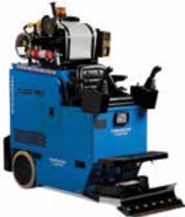
T2200 Pro Propane Riding Floor Scraper