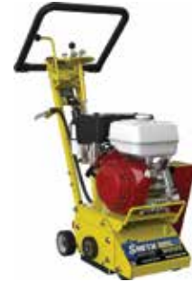
Smith 10" Gas Powered Scarifier