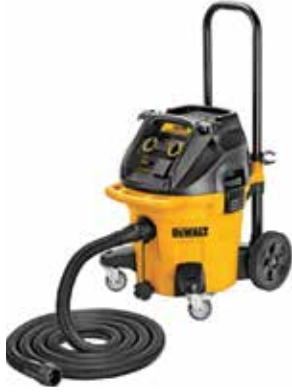
10 Gallon HEPA Vacuum (DWV102)