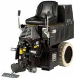
7700 Battery Powered Riding Scraper

Note: Pricing on all grinders includes up to 30 grit diamond segments and PCD's. Our scarifiers include drum. Shot sold separately.