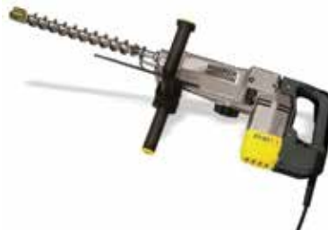
Rotary Demo Hammer SDS-Max