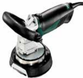
Hand Held Electric Scarifier