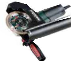
5" Grinder with Tuckpointing Shroud

Robust tuck pointing system with dust extraction for quick removal of mortar joints.