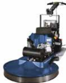
24" Propane Powered Burnisher